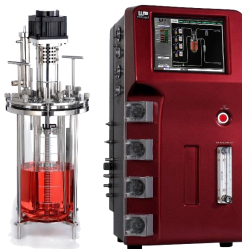
Winpact Model: FS-02-B10P

Syringomycin E (SRE) is a cyclic lipodepsinonapeptide with potent antifungal activity and is produced by certain strains of Pseudomonas syringae pv. syringae . In this study, its potential as an organic-compatible agrofungicide and vegetable seed treatment against the soilborne pathogen Pythium ultimum var. ultimum was examined. A variant of P. syringae pv. syringae strain B301D with enhanced SRE-producing capabilities was isolated and grown in a bioreactor with SRE yields averaging 50 mg/l in 40 h. SRE was extracted and purified through a large-scale chromatography system using organic-compatible processes and reagents. Organiccompatible and scalably produced SRE is potentially a novel organic fungicide seed protectant.