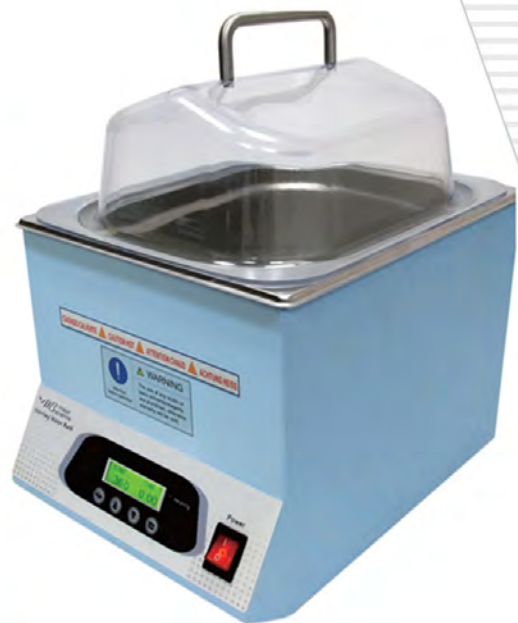
Stirring Water Bath