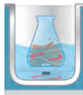
Water circulation function