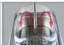
Concave lid design allows condensation flow back to the tank.