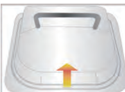
Side opening of the lid to allow minimum evaporation while maintaining water bath temperature.