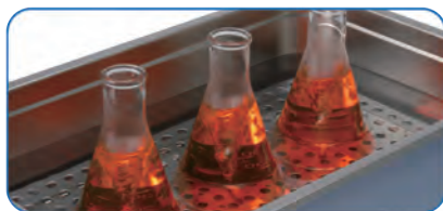
Built-in magnetic stirring mechanism ensures outstanding temperature uniformity